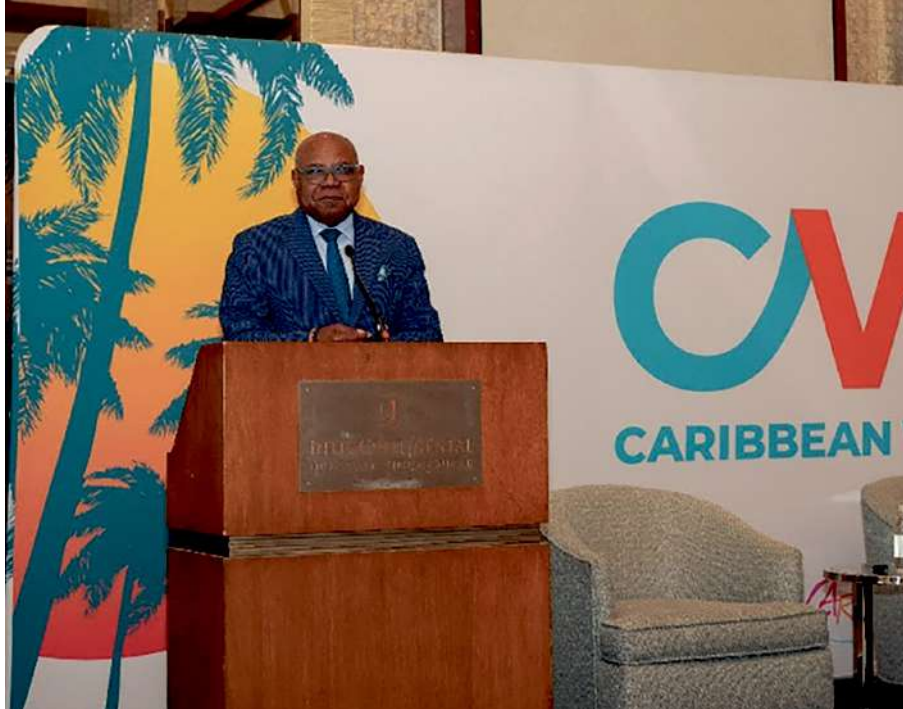
Jamaica Minister of Tourism, Edmund Bartlett addresses delegates at the Caribbean Tourism Organization’s (CTO) Caribbean Week at the Intercontinental Hotel in New York on June 1, 2026. (Contributed image)