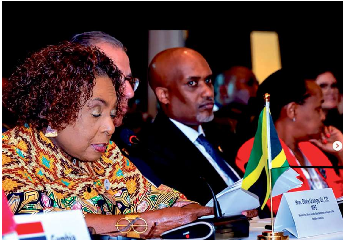
Jamaica's Culture, Gender, Entertainment and Sport Minister, Olivia Grange at the Ghana conference.

The petition will ask the King, in his role as Jamaica's Head of State, to refer three legal questions to the Privy Council, Jamaica's final appellate court. The questions