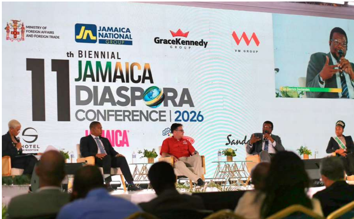
Panelists participate in one of several discussions held during the 2026 Jamaica Diaspora Conference in Montego Bay.

He and his ministers also addressed the continued